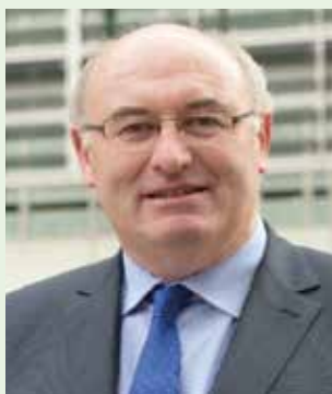
Phil Hogan Commissioner for Agriculture and Rural Development European Commission

'The Commission is committed to reinforcing support for rural communities and local authorities that wish to develop Smart Villages through capacity building, investments, innovation support, networking as well as through the provision of innovative financing tools for improving skills, services and infrastructure.'